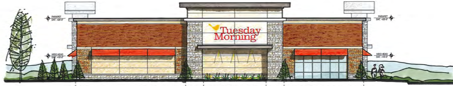
SIDE ELEVATION (east)