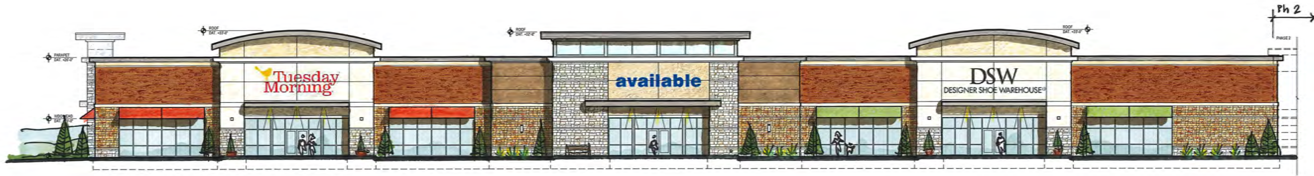
FRONT ELEVATION (north)