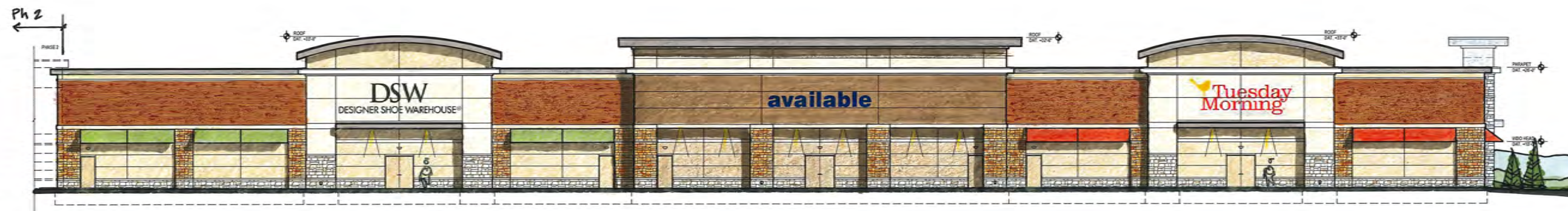
REAR ELEVATION (south)